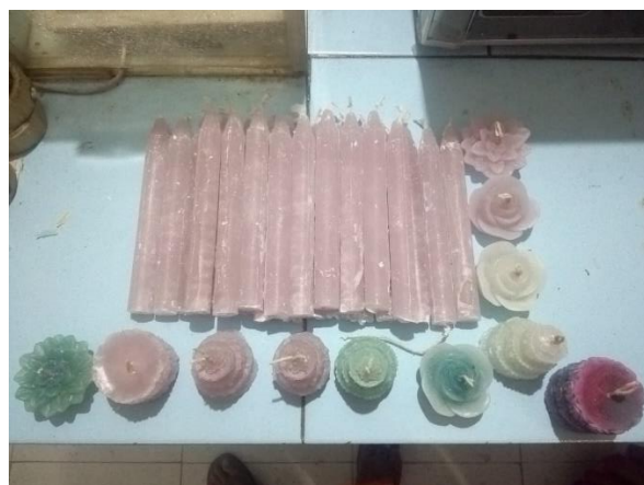
Training on "Decorative and Mosquito Repellent Candle Making" during 20 May to 2 June 2020