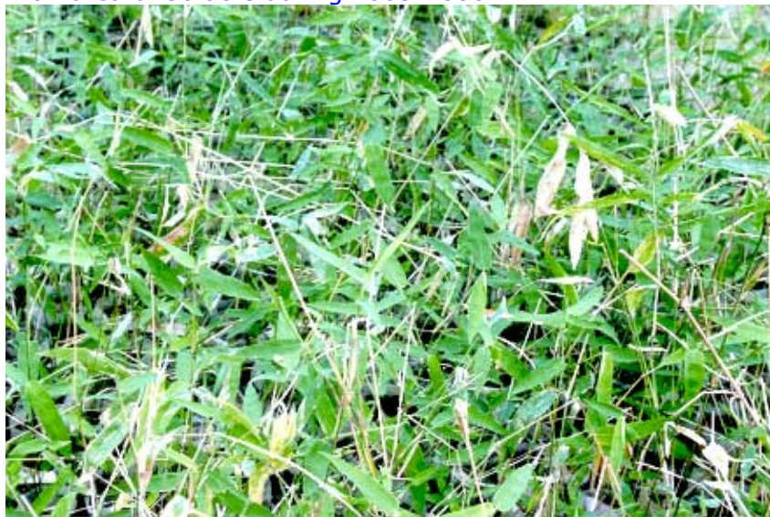
A bamboo seedling nursery with RRL Jorhat technical support at Dimapur

As a measure to check the soil erosion problem in hilly areas of Nagaland, the laboratory in 1980's undertook a wasteland development project by way introducing bamboo plantation and motivating the villagers to take up large scale bamboo plantations. A total of 10 villagers from Dimapur area took up bamboo cultivation in an area of 30 acre during 2005-2006.