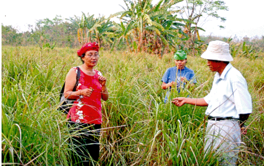
A lemongrass field at Nuiland, Dimapur