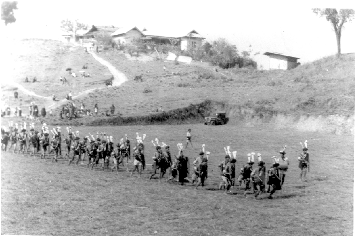
The Jubilant villagers in Traditional attire welcomed the CSIR chief

The activities in Yaongyimsen village acted as a catalyst and persistent requests poured in to RRL Jorhat to introduce such programmes in other villages in Nagaland. Encouraged by the success of Yaongyimsen project, citronella cultivation was later on extended to other places viz. Mongolomba, Mongsemyimti, Kublung, Kheriphema, Sirhima, Liqumi, Dhansiripar, Chingemi, Lusami and Tizit. The Directorate of Horticulture of Nagaland also started commercial cultivation of citronella, A number of entrepreneurs and NGOs are also engaged for commercial cultivation of citronella grass. The Govt. of Nagaland in association with RRL Jorhat has planned to go for large scale citronella cultivation and extraction of oil. During 2005-2006, 7 private growers from Dimapur and Chumukedima of Nagaland have newly started cultivation citronella grass.