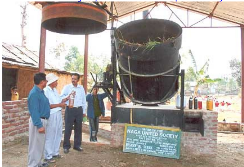
The Naga United Society - an NGO has taken up large scale cultivation and distillation of Citronella grass with the patronage of DBT and RRL Jorhat

Establishment of Java citronella on a commercial scale, gave the villagers a new kind of enthusiasm for taking up new ventures and as a result another variety of aromatic oil bearing, Eucalyptus citriodora was subsequently introduced in 1979. With this crop a massive scale plantation was taken up with a view to supplying raw materials for distillation of eucalyptus oil in the village. Approximately 25000 seedlings of eucalyptus were provided by RRL sub-station at free of cost. This plantation helped not only in economic upliftment of the villagers but also in keeping the effected ecology in balance due to felling of perennial trees and practice of jhumming.