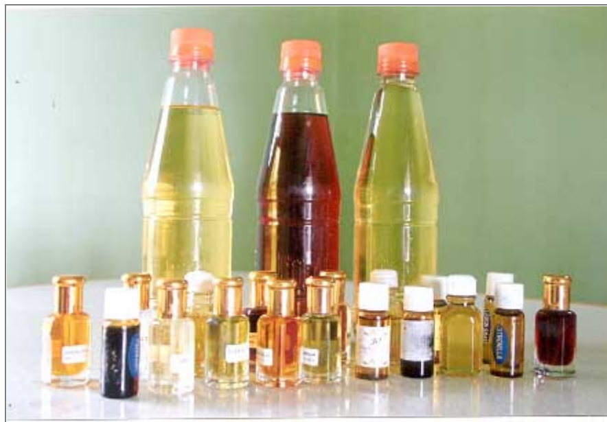
Samples of aromatic oil