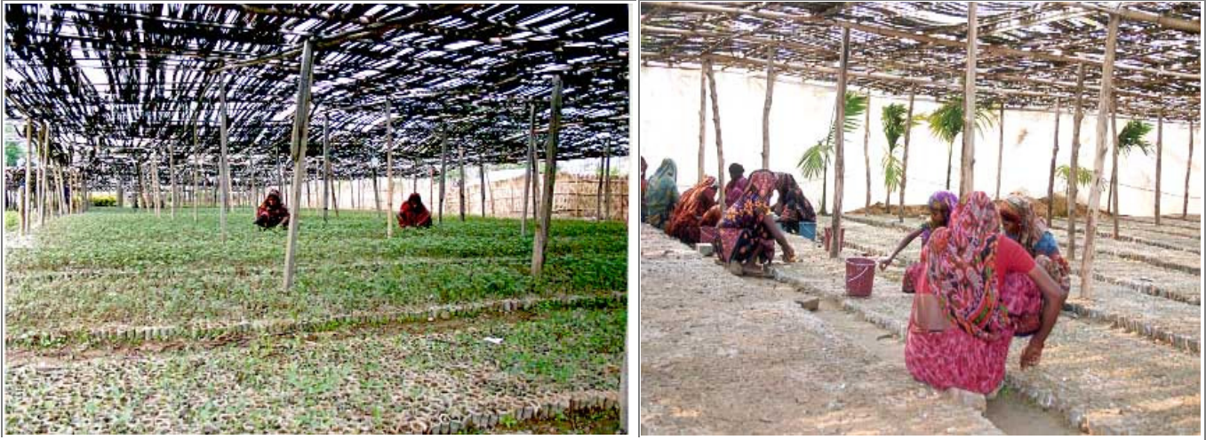
A view of a nursery of Patchouli saplings at Chumukedima village, Nagaland

the strong fixative properties and thus promotes tenacity of a perfume. The agro-climatic conditions of Nagaland favourable for cultivation of Patchouli. The laboratory introduced this particular high value plant species in Nagaland as an alternative commercial crop in 2005 and motivated the growers for its cultivation. As of today, as many as 22 entrepreneurs and growers from the places like Chumukedima, Dimapur, Nuiland, Kuhuboto have taken up commercial cultivation. Distillation plants are also coming up in private sectors and in a number of places.