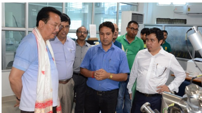
Visit to experimental farm and analytical facility.