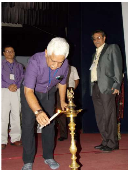
Caption of the photo 1.: The lighting of the lamp in the the inaugural programme of 8 th Mid-Year CRSI National Symposium in Chemistry at CSIR-NEIST, Jorhat on 10 th July 2014.