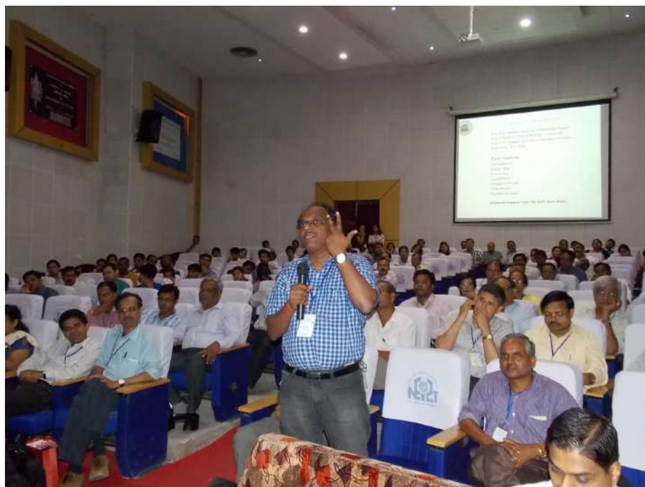
Caption of the photo 6.: Participants interacting with the speaker in the symposium at Dr JN Baruah Auditorium at CSIR-NEIST, Jorhat.