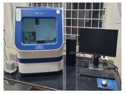
ABI 3500 Genetic Analyzer