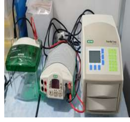
Bio-Rad TransBlot Turbo