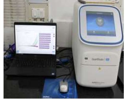
QuantStudio 5 Real-Time PCR