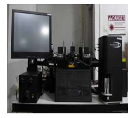
Leica Confocal Microscope Beckman Coulter Fluorescence Activated Cell Sorter