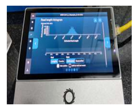
Oxford Nanopore Minlon Mk1C