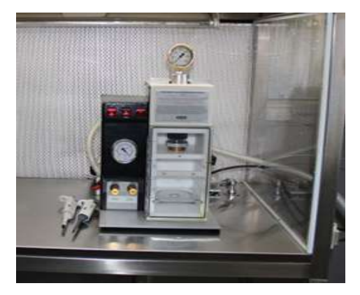
Bio-Rad Gene Gun/ Biolistic